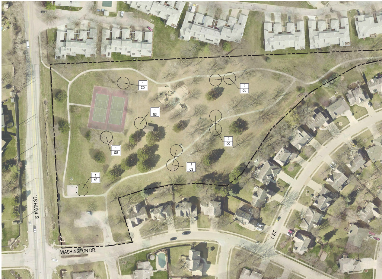
1 APPLEWOOD HEIGHTS PARK: PLANTING PLAN 1" = 50'